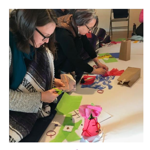
Square One Salons 3rd Saturdays of the month on Zoom 12:00 - 2:30 pm Central (US)

Create with others at one or all of these online programs.