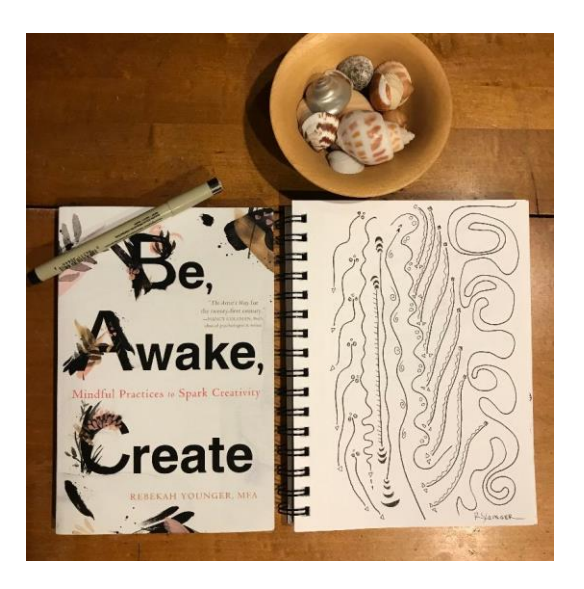
Be, Awake, Create & Relate Starts March 26, 2021

A full year, online guided creative journey with Rebekah Younger, author of <u>Be, Awake, Create</u>, with quarterly full day retreats, monthly group check-ins, private discussion board and emailed weekly prompts. Including new material, not found in the book. Suitable for all disciplines and experience levels with creating.